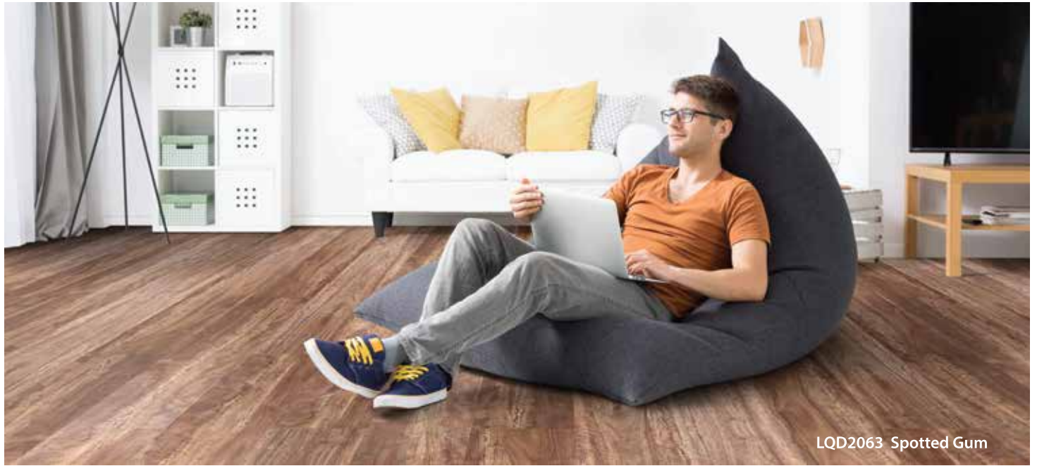
LQD2063 Spotted Gum