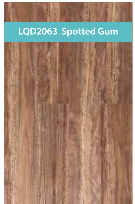
LQD2063 Spotted Gum

* Colours shown in the catalogue may vary from the actual product colours.